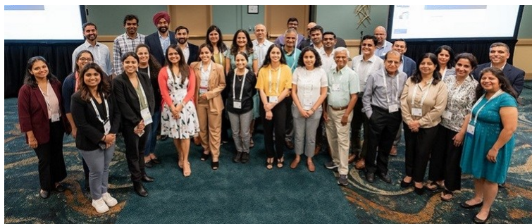
(Above): The Indian Association for Food Protection in North America met on July 15.

The following Affiliates also held Affiliate Meetings during IAFP 2024 in Long Beach, California.