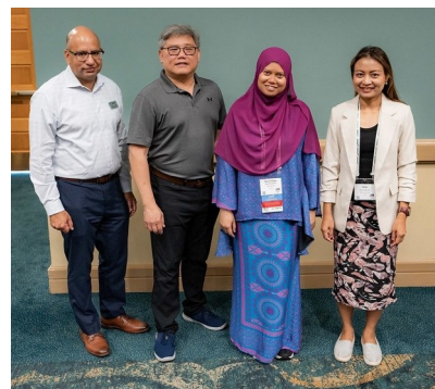
(Bottom right): The Chinese Association for Food Protection in North America met on July 15.